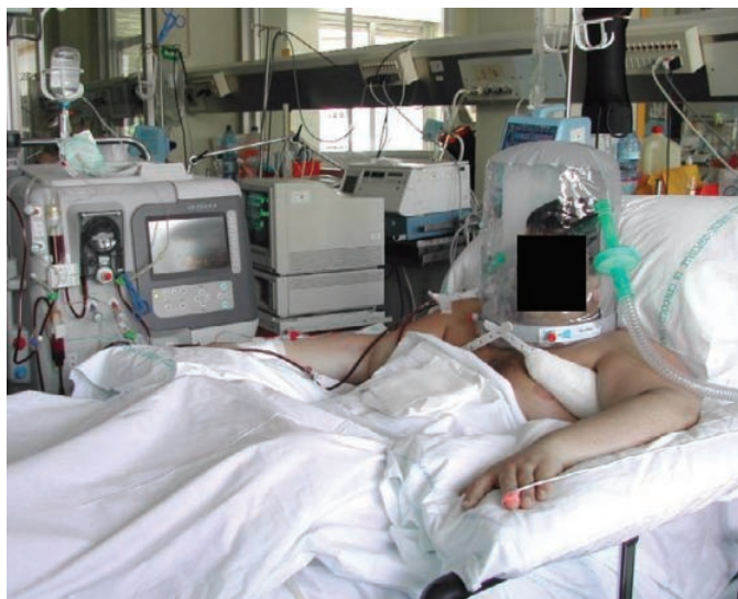
Figure 2: The Helmet to Provide Non-invasive Continuous Positive Airway Pressure in the Post-operative Period

and one-lung ventilation, with no PEEP). By contrast, in other randomised studies 46,47 including a heterogeneous group of major thoracic and abdominal surgical procedures, protective mechanical ventilation was not associated with a decrease in intra-pulmonary and systemic inflammation. Furthermore, there was no evidence that protective ventilation prevented lung adverse effects or decreased systemic cytokine levels in cardiac surgery. 48 However, adoption of a low tidal volume in patients without pre-existing lung injury may favour the development of atelectasis; hence, use of low tidal volume in the absence of recruitment or PEEP in anaesthetised patients without lung injury is not generally recommended. 49