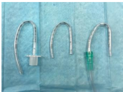
Figure 3: Modified 3.5 mm Ring-Adair-Elwyn (RAE) tube for insufflation of buccal oxygen. Image from left to right demonstrates: intact RAE tube; connector removed from tube and distal end cut above the Murphy eye; modified RAE tube with oxygen tubing attached to cut end.

Positioning the RAE tube in the left buccal space allows for the use of normal oropharyngeal and laryngeal airways [7]. When comparing buccal oxygenation to the nasopharyngeal catheter, it takes longer to assemble and some anesthetists may not have RAE tubes readily available in their operating room. Additionally, the tube length may need to be altered to prevent obstruction and allow for effective O 2 delivery [7]. Despite the concerns of airway patency, buccal oxygenation is a practical alternative and should be considered when the nasal route is contraindicated.