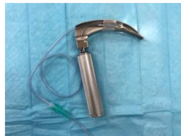
Figure 4: Adapted macintosh laryngoscope blade for laryngeal oxygen insufflation. A 14 fr suction catheter is secured to the blade. Proximal end of the catheter is connected to secondary oxygen tubing.

O 2 insufflation provides similar benefits, as compared to the nasopharyngeal catheter method by allowing direct delivery of O 2 to the pharynx and maintenance of oropharyngeal patency. Although laryngeal O 2 insufflation is an effective AO technique, O 2 is only insufflated when DL is performed and there is a potential concern for gastric distension if O 2 is insufflated into the esophagus.